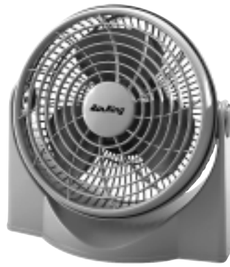
High Performance Pivot 9530