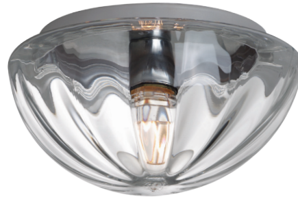
906288C Pinta 12

UL or ETL Listed. Suitable for Damp Locations. Interior Use Only.