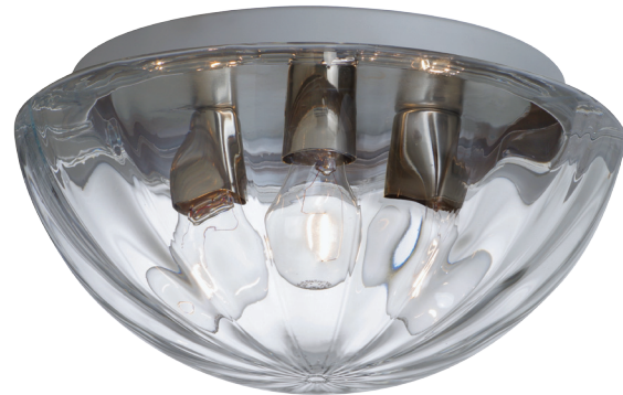
906288C Pinta 15