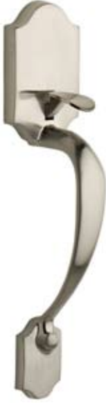
CZ2610 Colonial Style 2-Piece Handleset