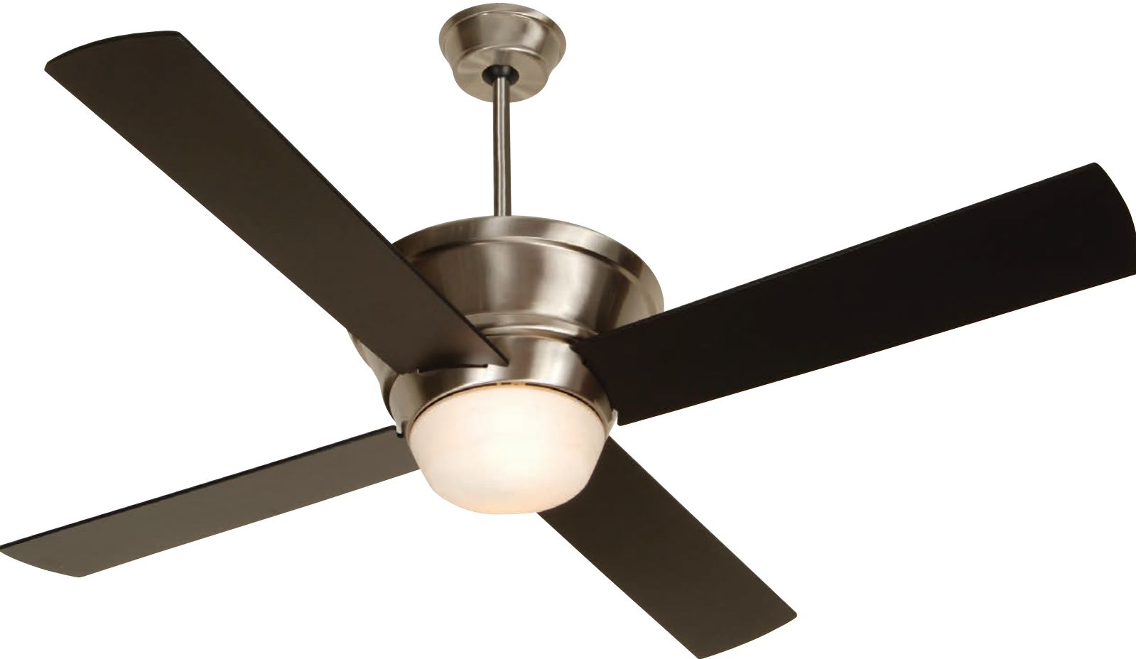
Stainless Steel Kira with 52" Kira Flat Black Blades and Integrated White Glass Light Kit | Model . . . . . KI52SS4 Blade . . . . . Included Light . . . . . Integrated