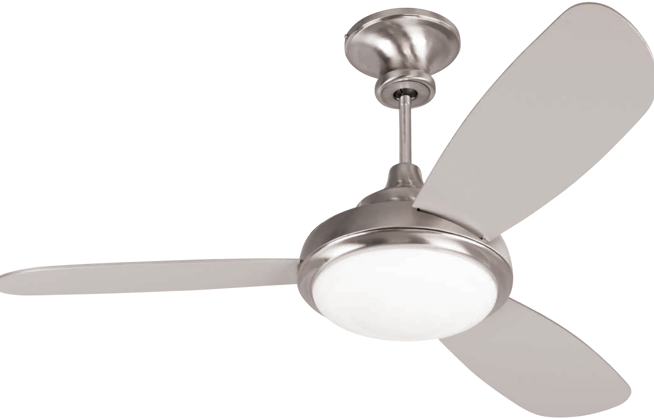
Stainless Steel Triumph 3 with 52" | Model . . . TR352SS3 Triumph 3 Brushed Nickel Blades | Blade . . . Included and Integrated Light Kit | Light . . . Integrated