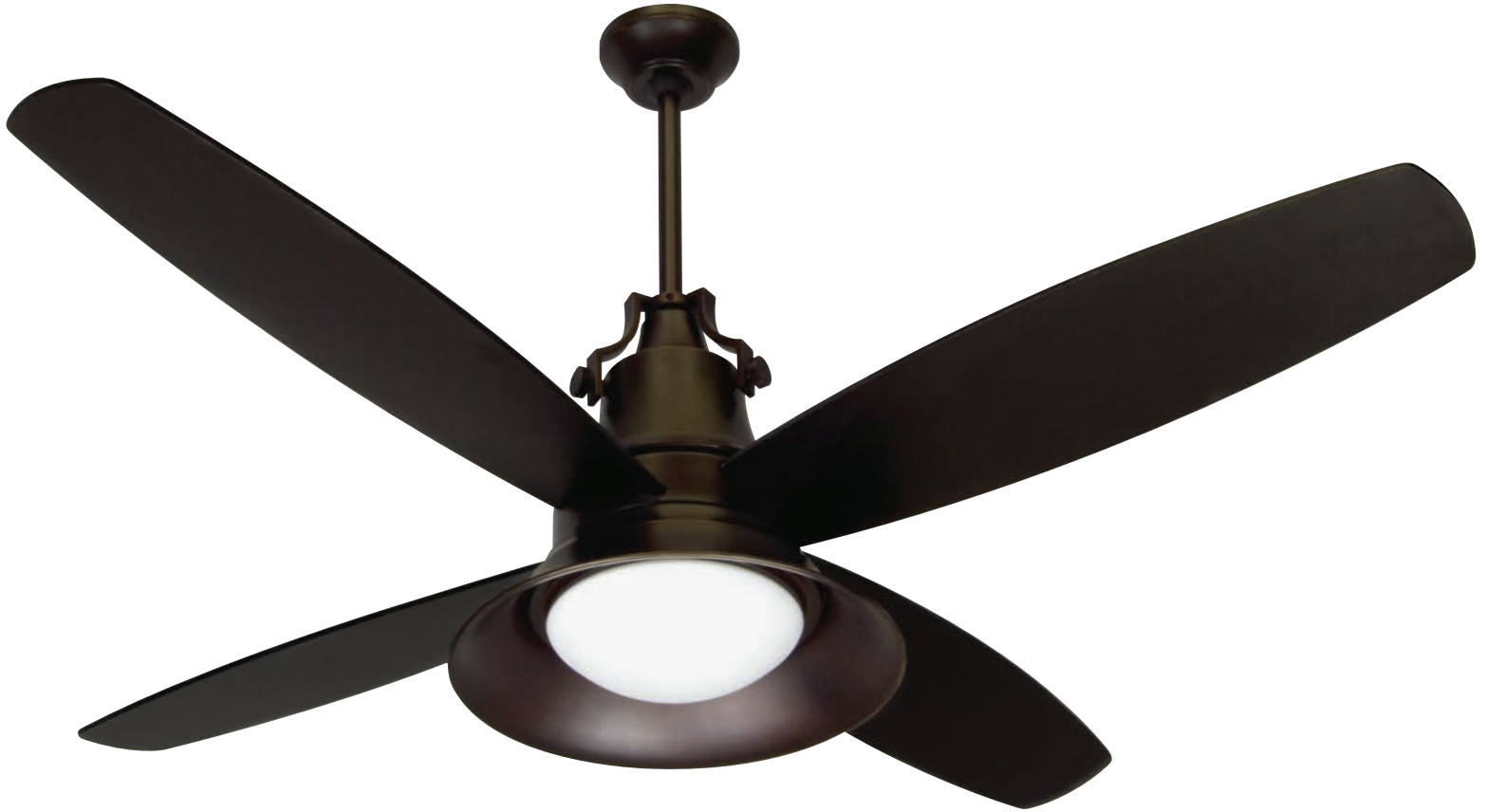
Oiled Bronze Gilded Union with 52" Outdoor Custom Oiled Bronze Blades and Integrated Light Kit Model . . . UN520BG4 Blade . . . Included Light . . . Integrated