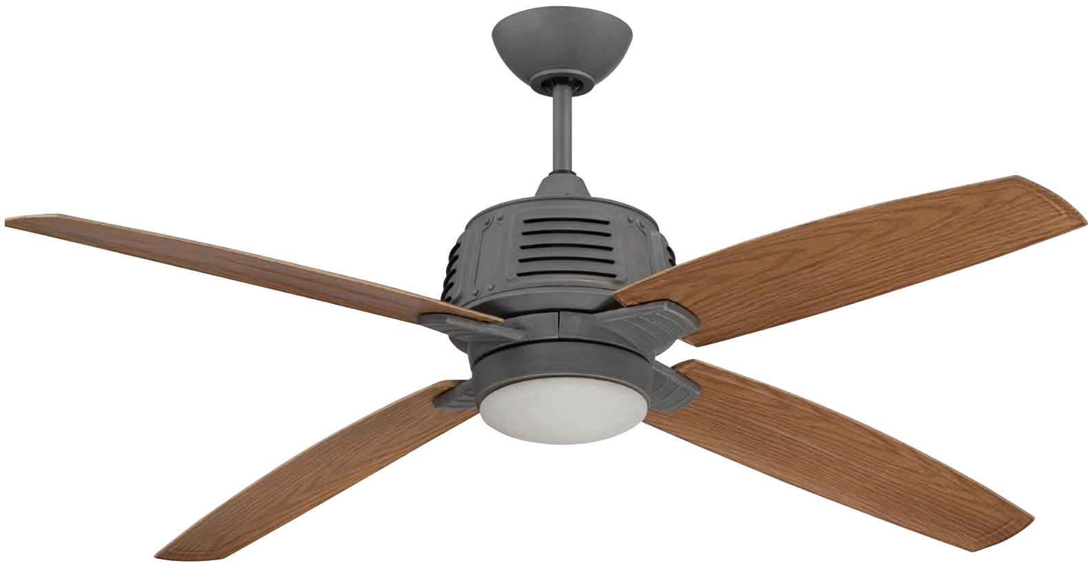
Antique Galvanized Louver with 52" Light Oak with Woodgrain ABS Blades and Frosted White Light Kit | Model . . . . LOU52AGV4 Blade . . . . Light Oak w/ Woodgrain Light. . . . . Included