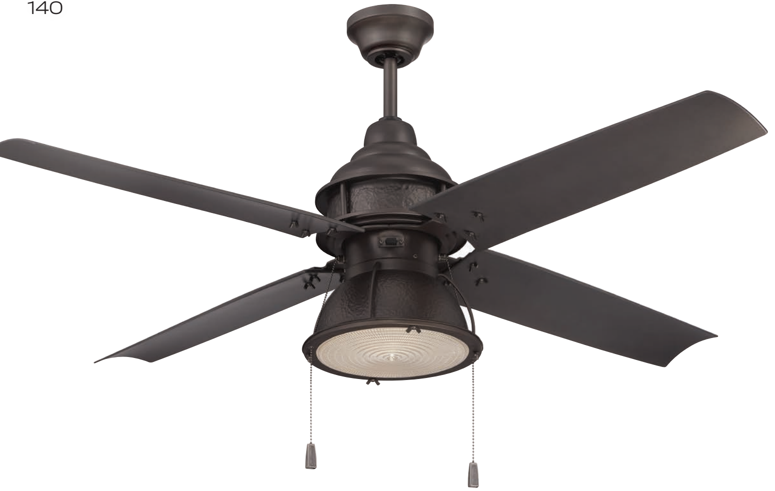
Espresso Port Arbor with 52" Blades and Integrated Light Kit | Model . . . PAR52ESP4 Blade . . . Included Light . . . Integrated