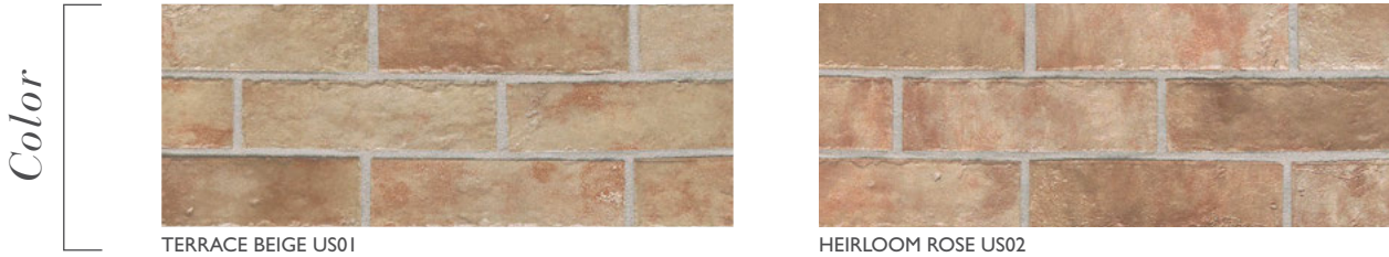
TERRACE BEIGE US01