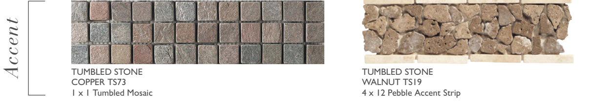
TUMBLER STONE COPPER TS73 1 x 1 Tumbled Mosaic