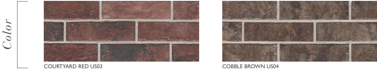
COURTYARD RED US03