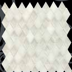
Silver Cloud AU30 1 x 2 Harlequin