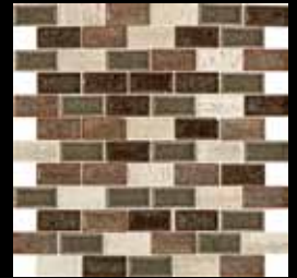
Autumn Haze AU33 1 x 2 Brick-joint