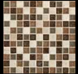
Autumn Haze AU33 1 x 1 Mosaic