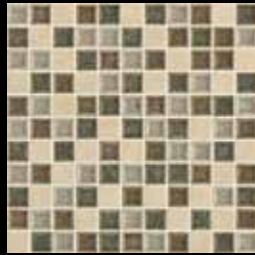
Meadow Mist AU31 1 x 1 Mosaic