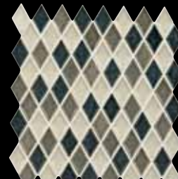
Ocean Spray AU32 1 x 1 Mosaic