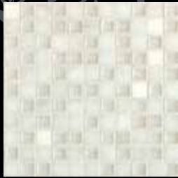
Silver Cloud AU30 1 x 1 Mosaic