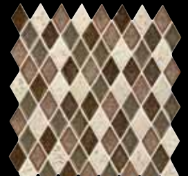
Autumn Haze AU33 1 x 2 Harlequin