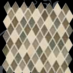
Meadow Mist AU31 1 x 2 Harlequin