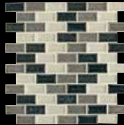
Ocean Spray AU32 1 x 2 Brick-joint