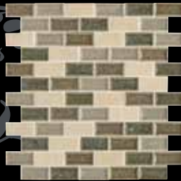
Meadow Mist AU31 1 x 2 Brick-joint