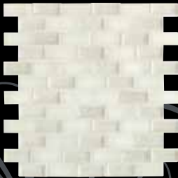
Silver Cloud AU30 1 x 2 Brick-joint