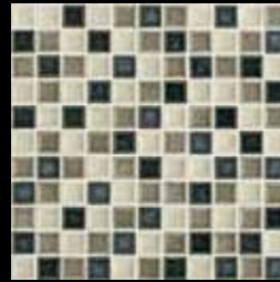
Ocean Spray AU32 1 x 2 Harlequin