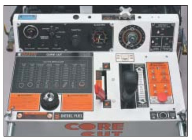
CC7100 Control Panel