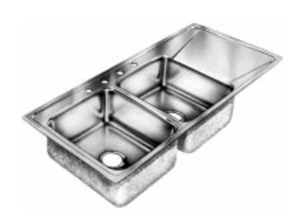
Model ILR-4822-L-4 Shown