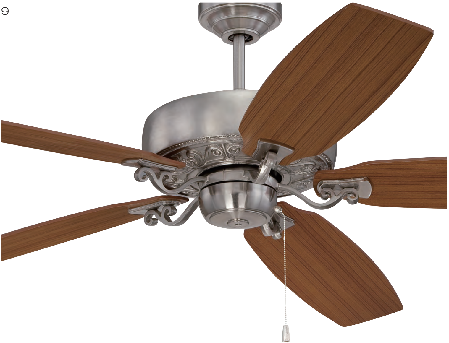
Brushed Polished Nickel 64" Patterson Blades Light Kit Model . . . PAT64BNK5 Walnut/Maple Optional