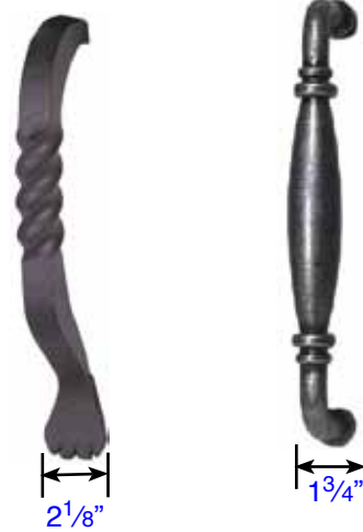
San Carlos Grip Part # UL 3315