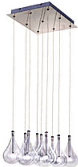
E20116-18 Larmes 9-Light Pendant