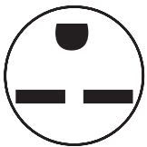
Plug Type (NEMA) 6-30P

1 Warranty 5 year sealed system/1 year full parts and labor.