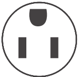
Plug Type (NEMA) 5-15P

1 Warranty 5 year sealed system / 1 year full parts and labor.