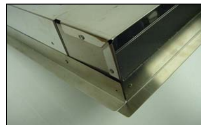
*3/4" Flange for perfect fit. Flange NOT included. Must be ordered separately.