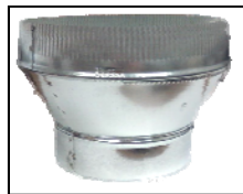
10" Transition 10" Round x 7-1/2" high