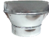
10" Round x 7-1/2" High

NOTE: 10" round transition attached to duct opening.