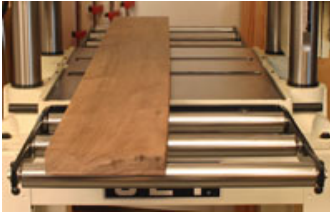
Table and Extensions

With the included three-roller extension tables there is 48" of support for the wood as it goes through.