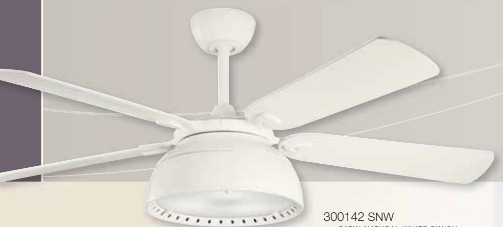
300142 SNW SATIN NATURAL WHITE FINISH SHOWN WITH SATIN NATURAL WHITE BLADES AND WHITE ETCHED GLASS