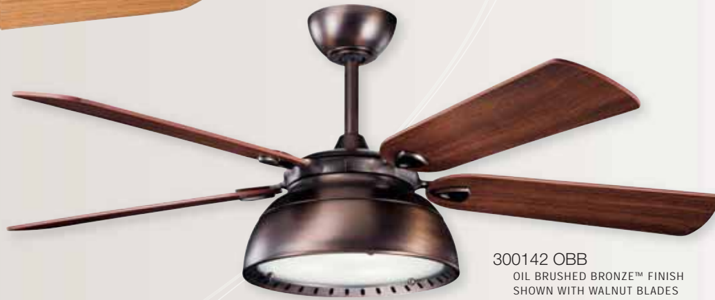
300142 OBB OIL BRUSHED BRONZE™ FINISH SHOWN WITH WALNUT BLADES AND WHITE ETCHED GLASS