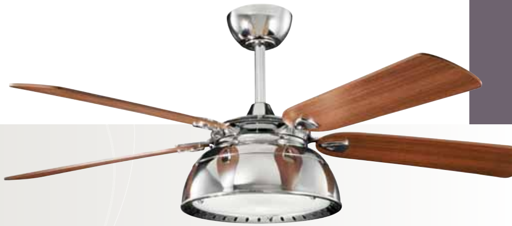
300142 PN POLISHED NICKEL FINISH SHOWN WITH SAPELLE BLADES AND WHITE ETCHED GLASS