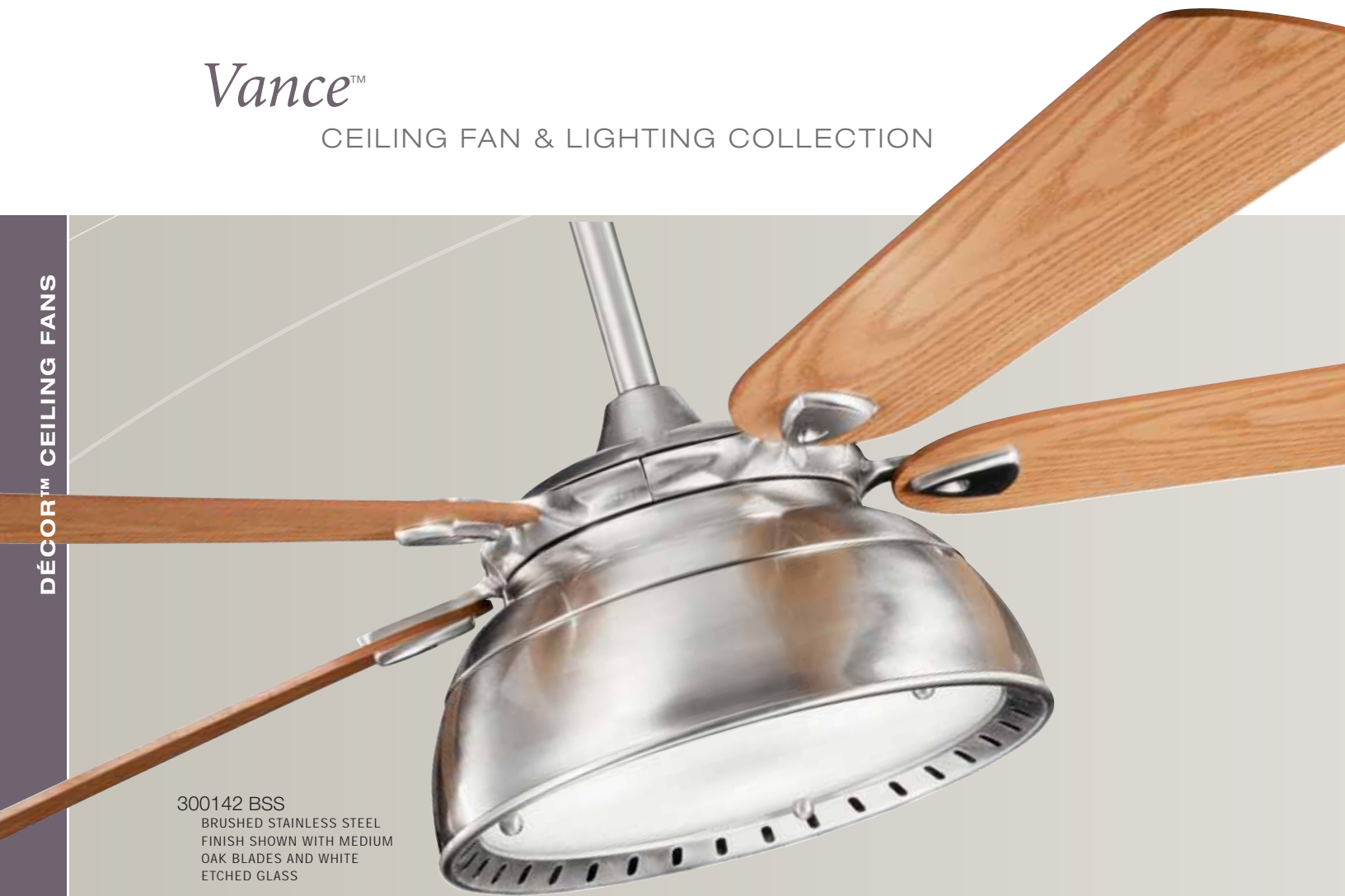
300142 BSS BRUSHED STAINLESS STEEL FINISH SHOWN WITH MEDIUM OAK BLADES AND WHITE ETCHED GLASS