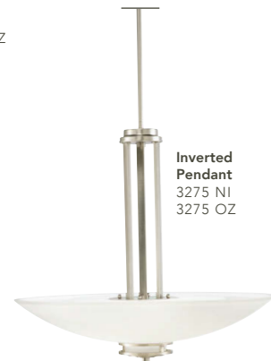
Inverted Pendant 3275 NI 3275 OZ