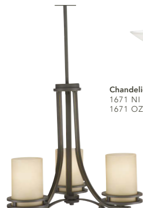
Chandelier 1671 NI 1671 OZ