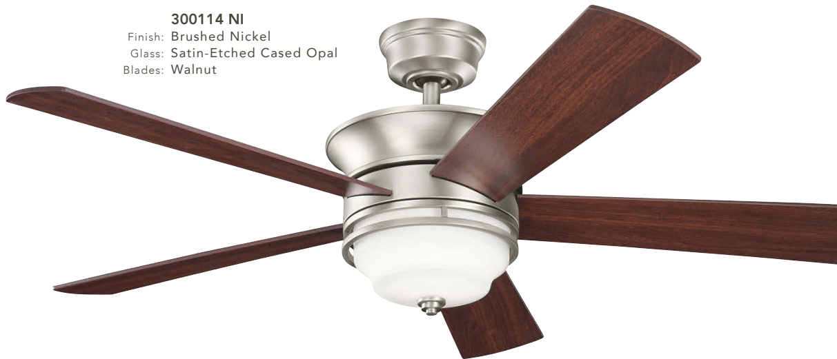
300114 NI Finish: Brushed Nickel Glass: Satin-Etched Cased Opal Blades: Walnut