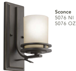
Sconce 5076 NI 5076 OZ

To see the complete Hendrik™ Collection visit kichler.com .