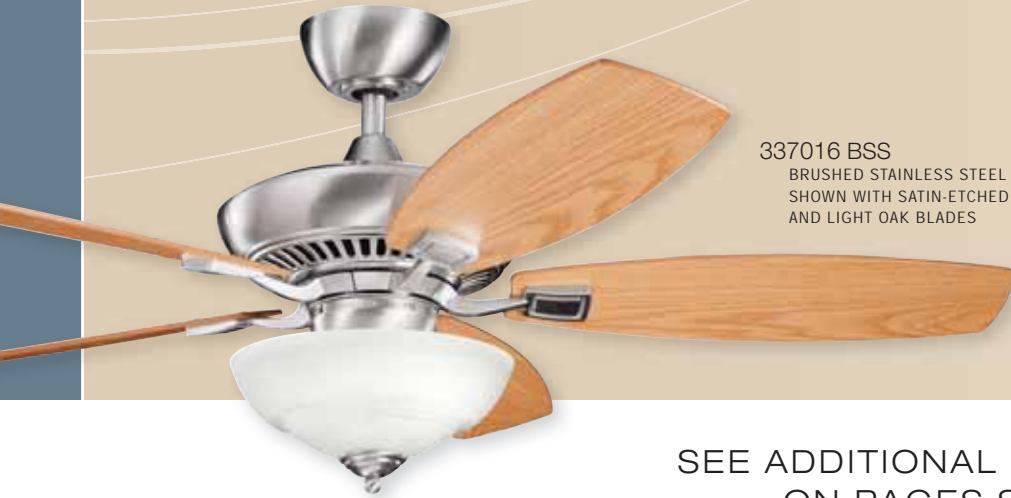
337016 BSS BRUSHED STAINLESS STEEL FINISH SHOWN WITH SATIN-ETCHED GLASS AND LIGHT OAK BLADES

SEE ADDITIONAL FINISH OPTIONS ON PAGES S280-S281.