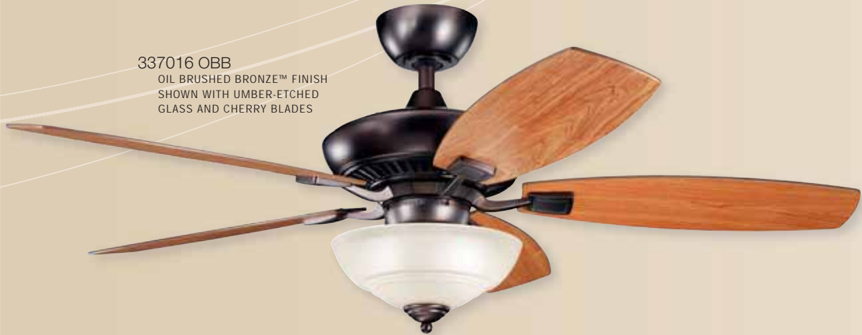
337016 OBB OIL BRUSHED BRONZE™ FINISH SHOWN WITH UMBER-ETCHED GLASS AND CHERRY BLADES