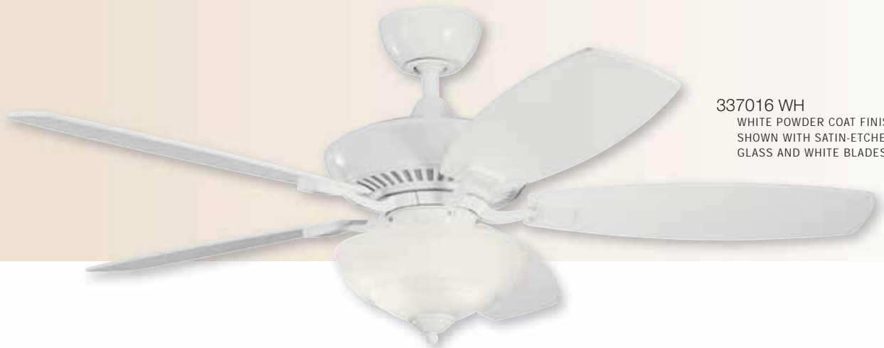
337016 WH WHITE POWDER COAT FINISH SHOWN WITH SATIN-ETCHED GLASS AND WHITE BLADES