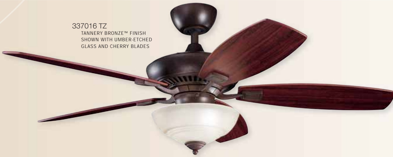
337016 TZ TANNERY BRONZE™ FINISH SHOWN WITH UMBER-ETCHED GLASS AND CHERRY BLADES