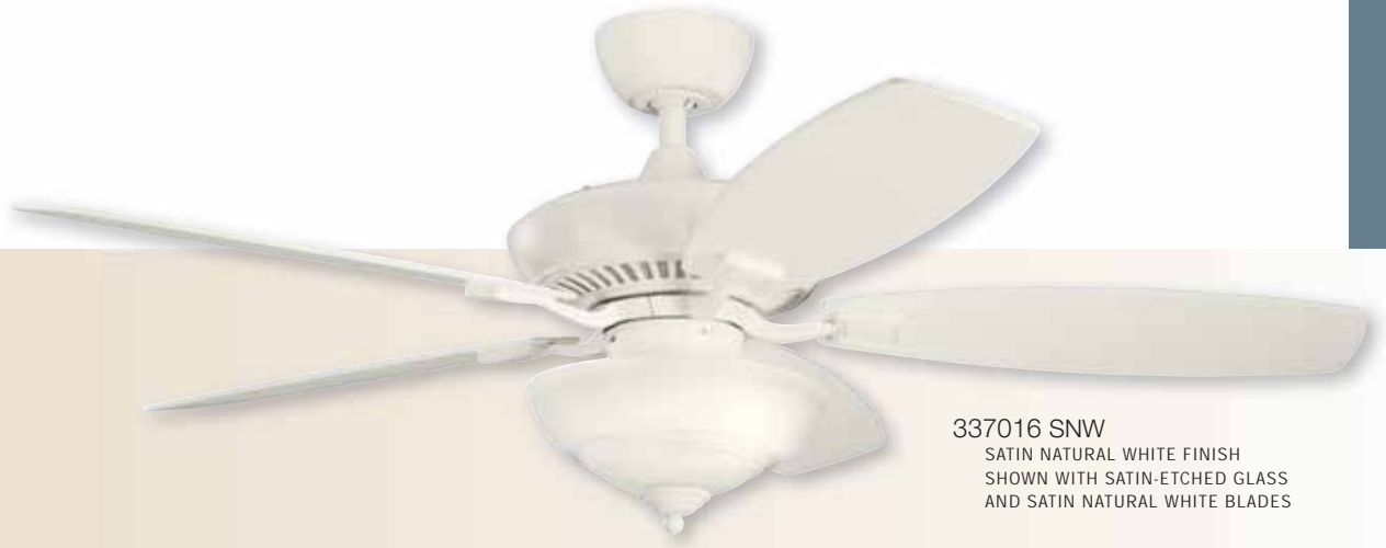
337016 SNW SATIN NATURAL WHITE FINISH SHOWN WITH SATIN-ETCHED GLASS AND SATIN NATURAL WHITE BLADES