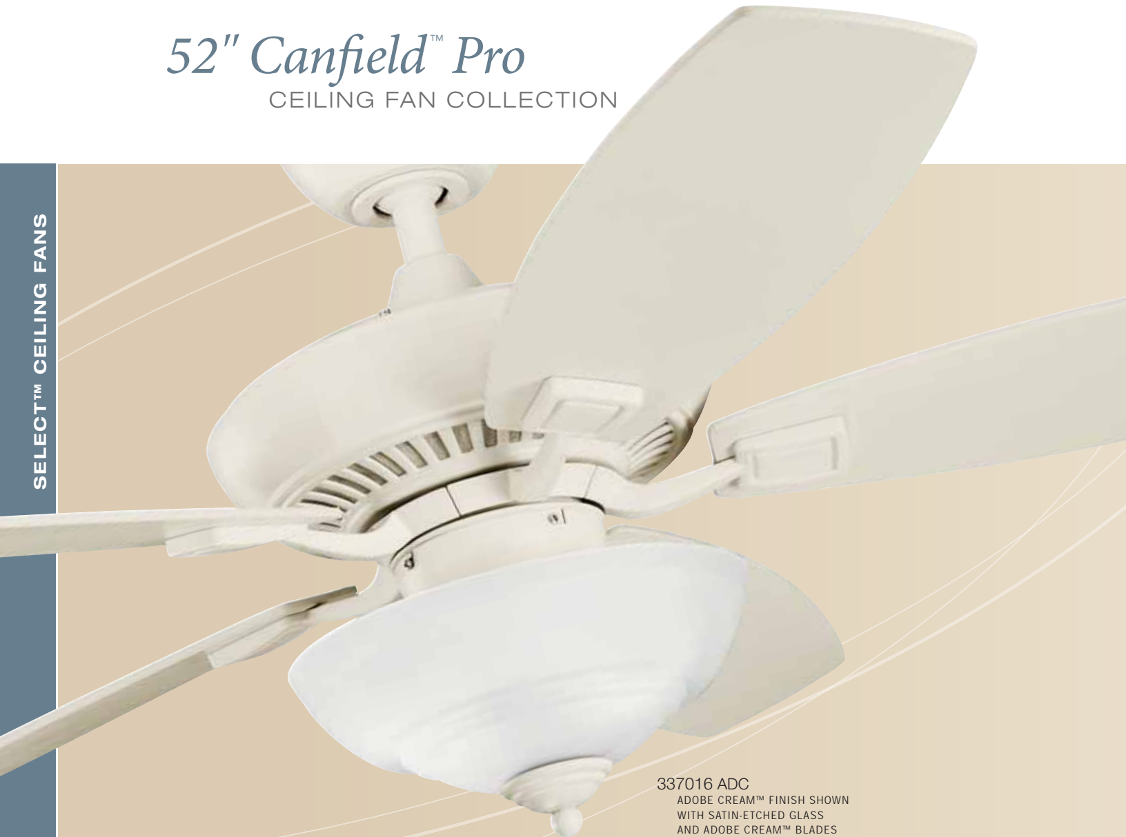
337016 ADC ADOBE CREAM™ FINISH SHOWN WITH SATIN-ETCHED GLASS AND ADOBE CREAM™ BLADES