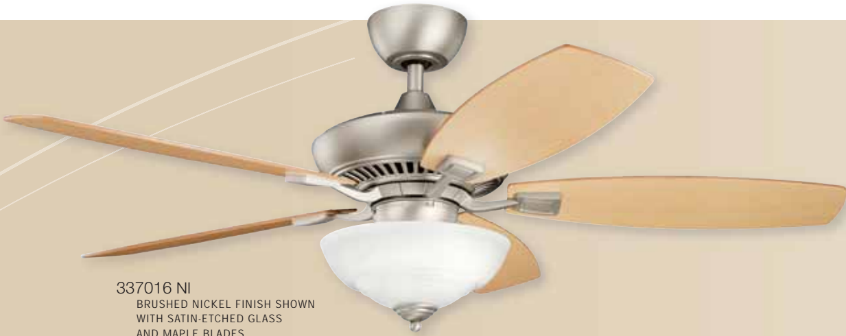
337016 NI BRUSHED NICKEL FINISH SHOWN WITH SATIN-ETCHED GLASS AND MAPLE BLADES