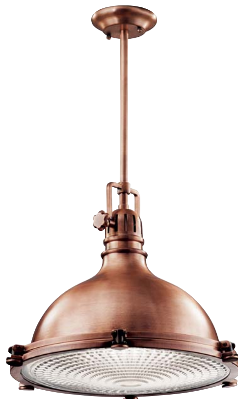
E | 2691 ACO