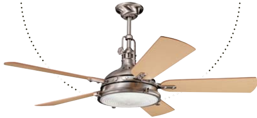
A | 300018 BSS

See the full line of Kichler® Ceiling Fans in catalog K414 or visit kichler.com