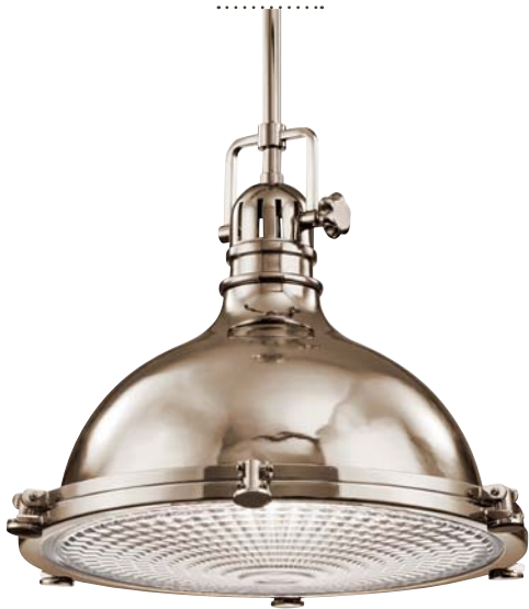
D | 2691 PN