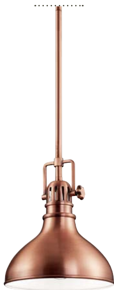
A | 2664 ACO

ANTIQUÉ COPPER FINISH WITH CLEAR FRESNEL LENS