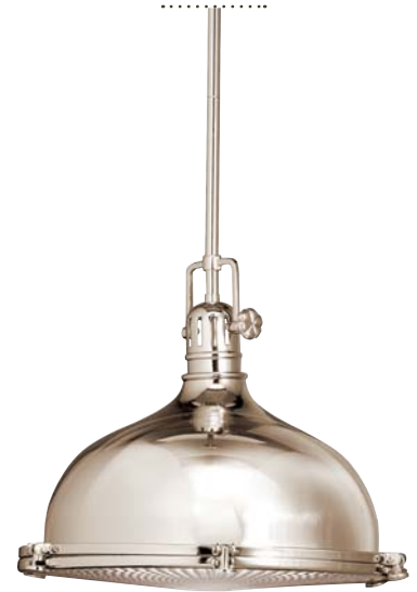
F | 2666 PN