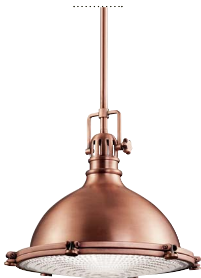
C | 2666 ACO