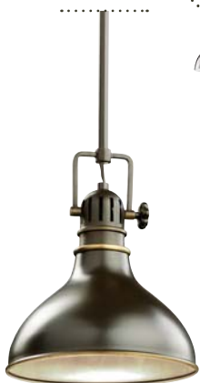
A | 2664 OZ

OLDE BRONZE® FINISH WITH CLEAR FRESNEL LENS