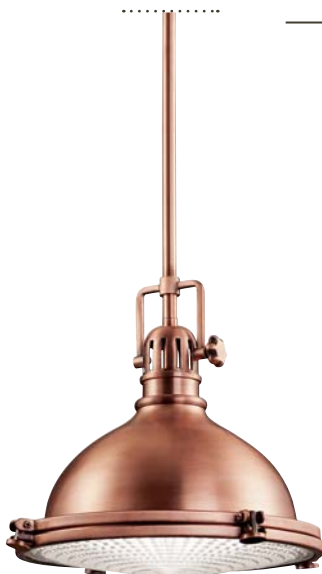
B | 2665 ACO