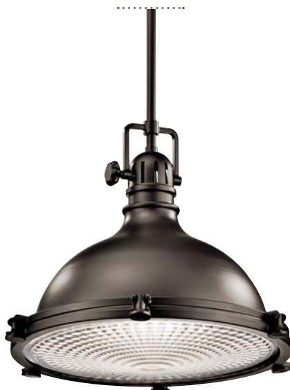
D | 2682 OZ