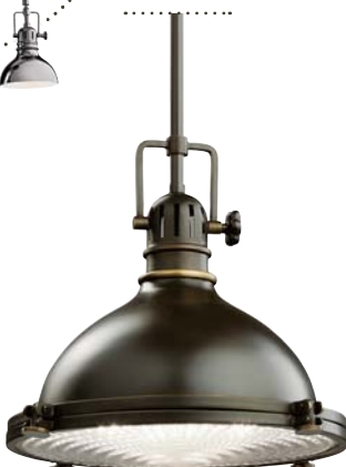
B | 2665 OZ