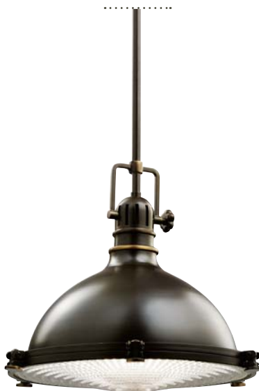
C | 2666 OZ