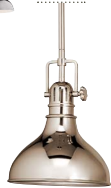
C | 2664 PN