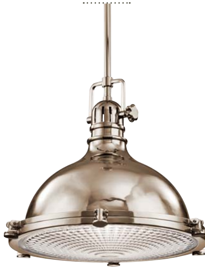
E | 2682 PN