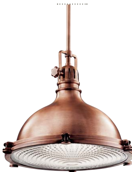
D | 2682 ACO