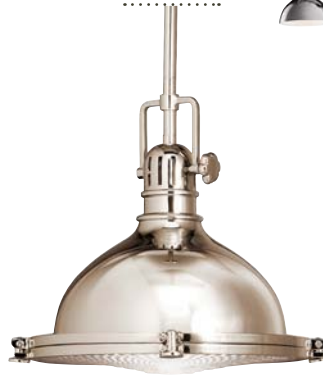
B | 2665 PN