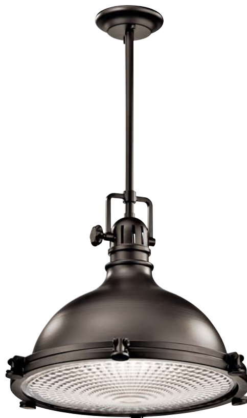
E | 2691 OZ