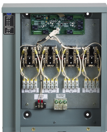
LCM with Terminal Block Connections