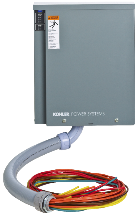
LCM with Pre-Wired Harness

ISO 9001 KOHLER POWER SYSTEMS NATIONALLY REGISTERED