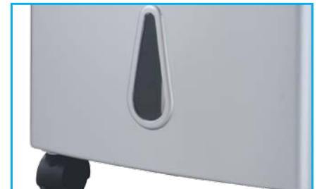
Water level indicator