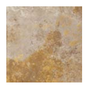
UE3H Jade Taupe 20"x20"