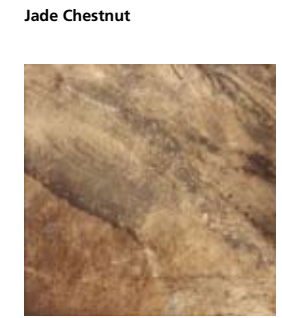
UE3E Jade Chestnut 20"x20"