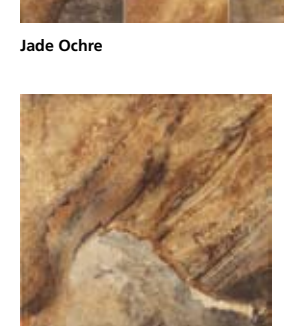
UE3F Jade Ochre 20"x20"