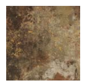
UE3G Jade Sage 20"x20"