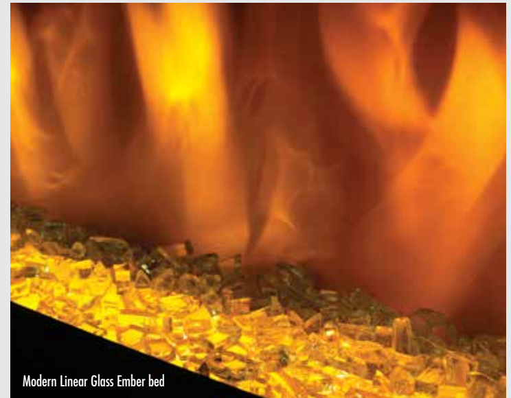
Modern Linear Glass Ember bed

Slimmest Electric Fireplace in the industry! Napoleon's new Electric Slimline Series offer a clean, crisp contemporary design and the conveniences of simply hanging, plugging in and enjoying. Napoleon's Electric Slimline Series features an unmatched flame technology and realistic flame pattern, a generous glass front with wide black glass framing, a contemporary glass ember bed that complements the minimalist design and an LED light strip. All units can be recessed into a 2" x 4" wall for reduced protrusion into the room or surface mounted on the wall. A beautiful way to add ambiance and comfort to any room in the home.