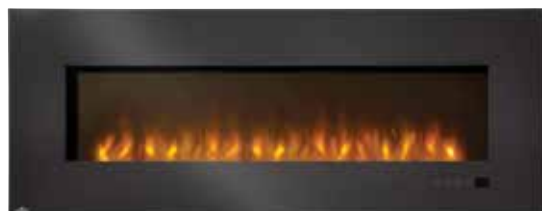
EFL60H | Electric Fireplace