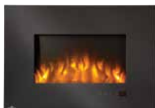
EFL32H | Electric Fireplace