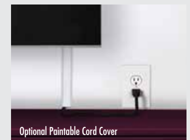
Optional Paintable Cord Cover