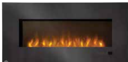
EFL48H | Electric Fireplace