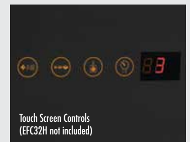
Touch Screen Controls (EFC32H not included)