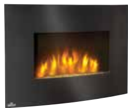
EFC32H | Convex Front Electric Fireplace