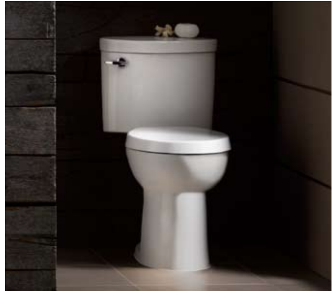
Seat shown above is not available. Please see Price Book for round front seat options.

28-1/4" x 17-1/4" x 30-3/4" (717 x 437 x 780mm)