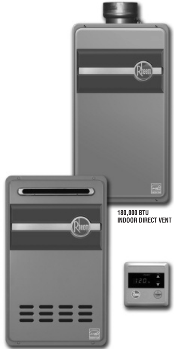
180,000 BTU INDOOR DIRECT VENT

See Commercial Warranty Brochure for details.