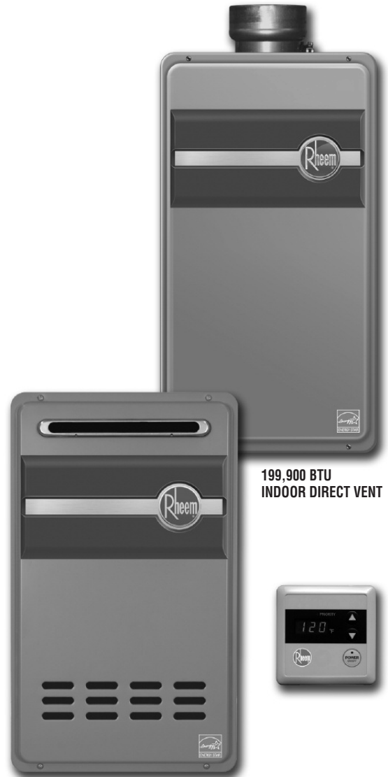
199,900 BTU INDOOR DIRECT VENT