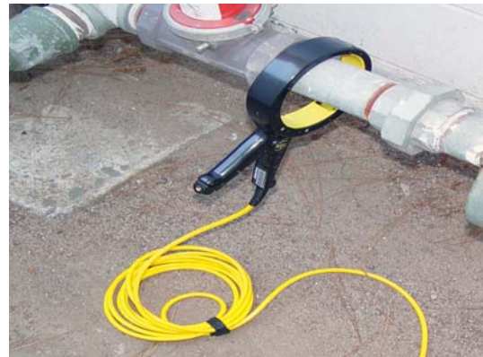
Figure 4: Example: Attaching the Inductive Clamp