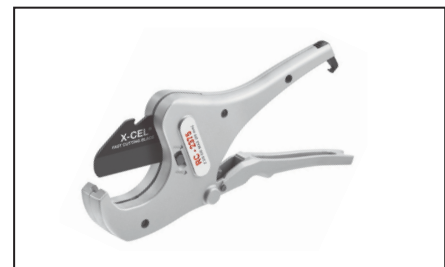
PC-2375 Ratcheting Tubing Cutter