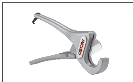
PC-1375 Tubing Cutter