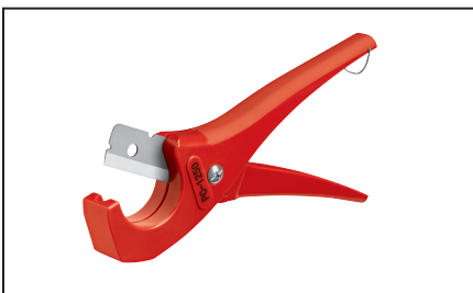
PC-1250 Scissor-Style Cutter