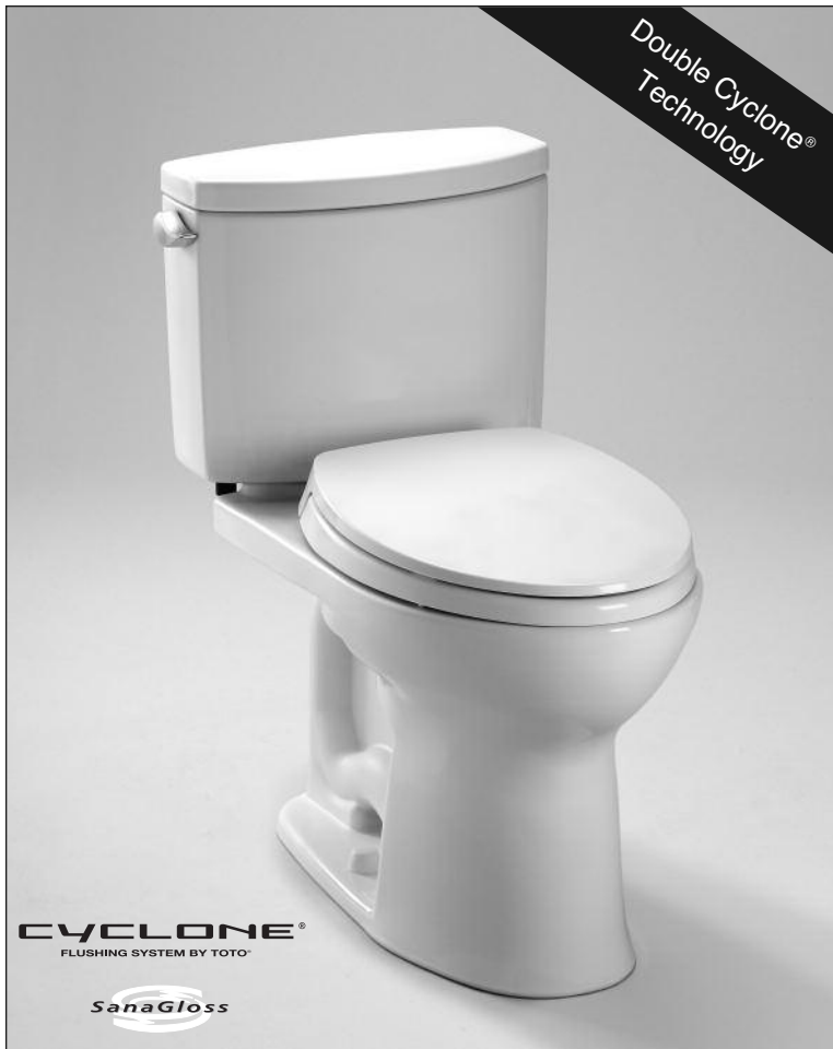
CST454CEFG - Drake® II Two-Piece Toilet