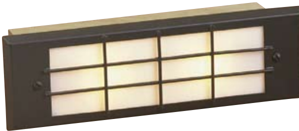
17 Grille Natural Antique Bronze (NAZ)