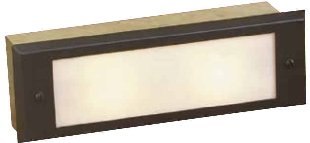
16 Window Natural Antique Bronze (NAZ)