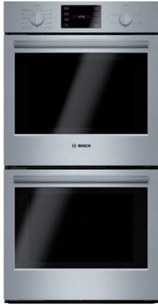
HBN5651UC Stainless Steel

The Bosch wall oven features Genuine European Convection and heavy metal stainless steel knobs.