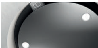
LED ambient light