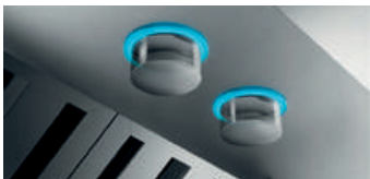
IN/OUT Backlit Knob

Designed to be suspended above a kitchen island, Vavano's crisp lines, beveled rim and gleaming stainless steel deliver professional cooking with a sense of style. Give your kitchen a splash of Italian design with a box style island hood that has the extra depth and power required to support professional ranges and cooktops.