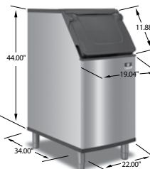
D420 310 lbs. (141 kgs) (Available January)