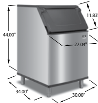
D570 430 lbs. (195 kgs) (Available January)