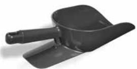
Ergonomic NSF approved sanitary ice scoop included