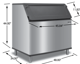
D970 710 lbs. (323 kgs)