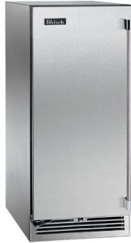
Solid Door Model