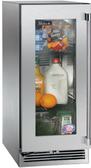
Glass Door Model