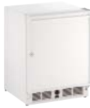
WHITE SOLID (LOCK)