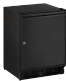
BLACK SOLID (LOCK)