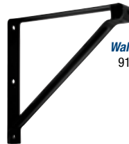
Wall Mount 9100WC