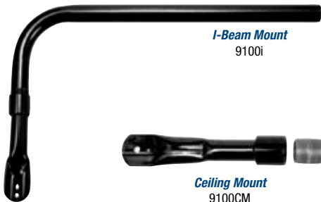
Ceiling Mount 9100CM