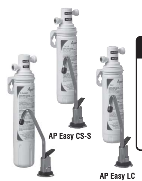
AP Easy Complete