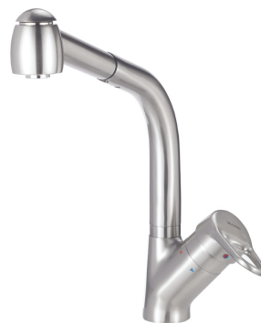
Model 441186 shown