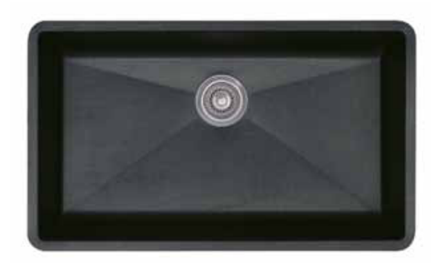
Model 440149 shown