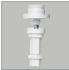
STA-TITE® RESIDENTIAL FASTENING SYSTEM™