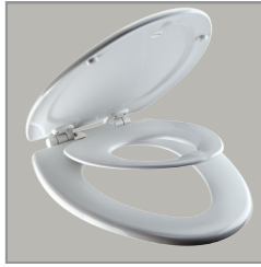
CHILD SEAT SECURES MAGNETICALLY INTO COVER WHEN NOT IN USE