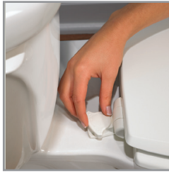
TWIST HINGE TO UNLOCK