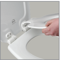
REMOVABLE CHILD SEAT