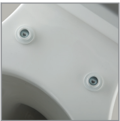
EASY REMOVAL OF SEAT FOR THOROUGH CLEANING