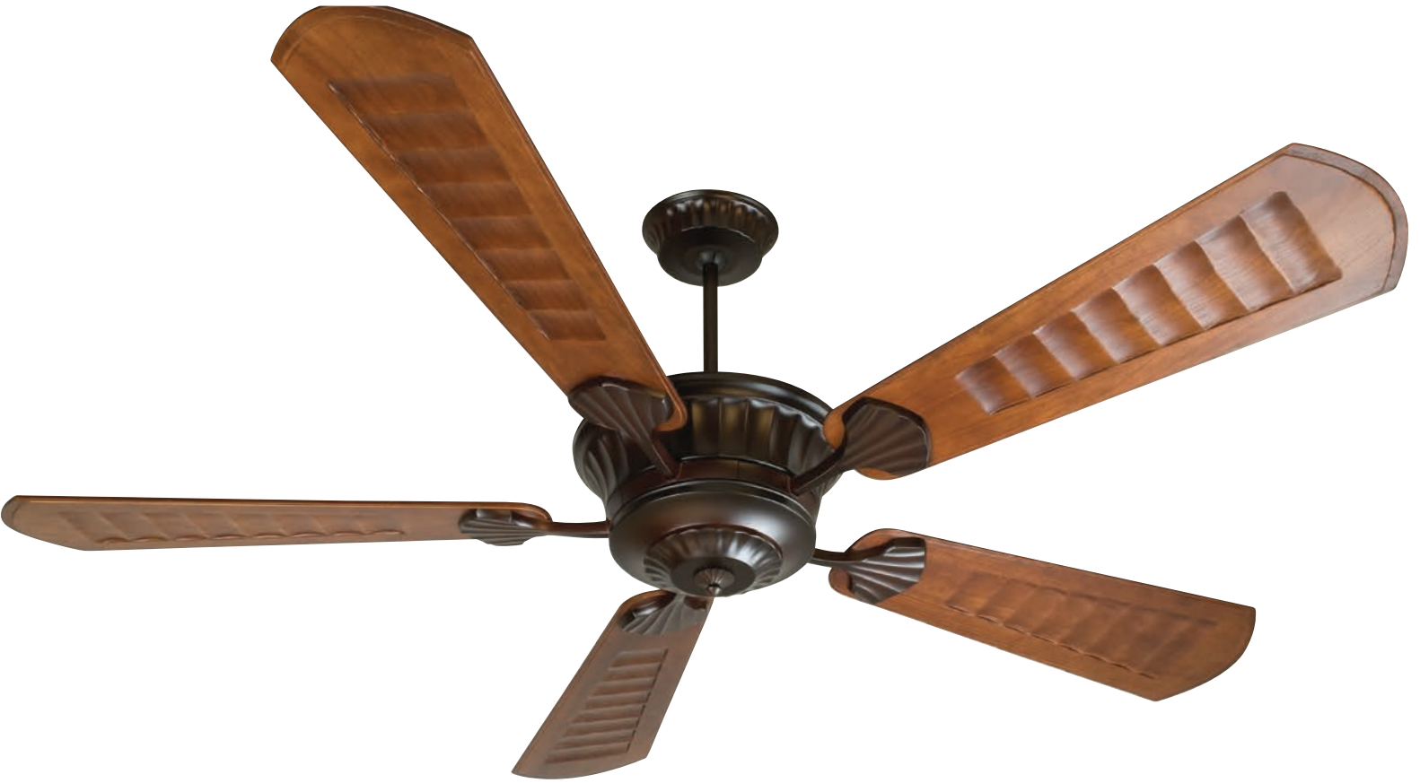
Oiled Bronze Epic with 70" Custom Carved Scalloped Walnut Blades | Model . . . . DCEP700B Blade . . . . B570C-1 Light . . . . Not Shown