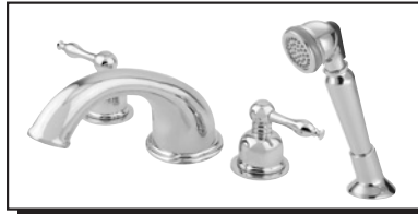
D302855 (shown) SHERIDAN™

Danze faucets are covered by a manufacturer's limited "lifetime" warranty for manufacturing defects