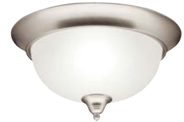
E | 8064 NI, TZ Flush Mount