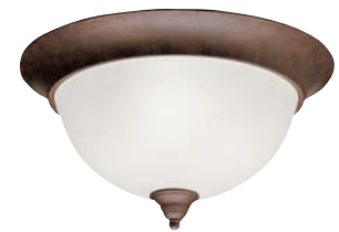
G | 8065 NI, TZ Flush Mount