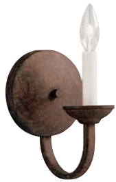
A | 6620 TZ Wall Sconce

BRUSHED NICKEL OR TANNERY BRONZE™ FINISH WITH ETCHED SEEDY GLASS