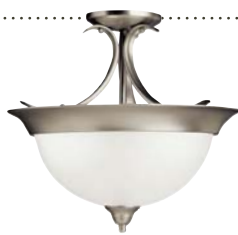
K | 3623 NI, NIA, OZ, TZ 3623 NIFL, OZFL, TZFL Semi Flush