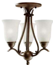
Shown as Semi Flush 11.75" H.