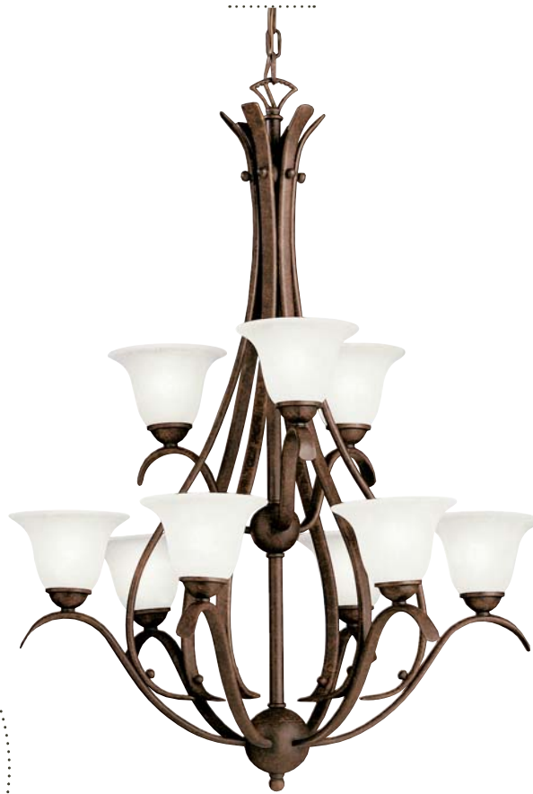
C | 2520 NI, TZ Chandelier