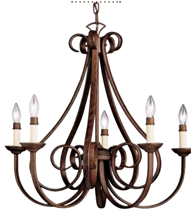
E | 2021 NI, TZ Chandelier