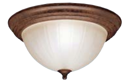
F | 8654 NI, TZ Flush Mount