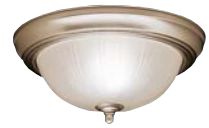
D | 8653 NI, TZ Flush Mount