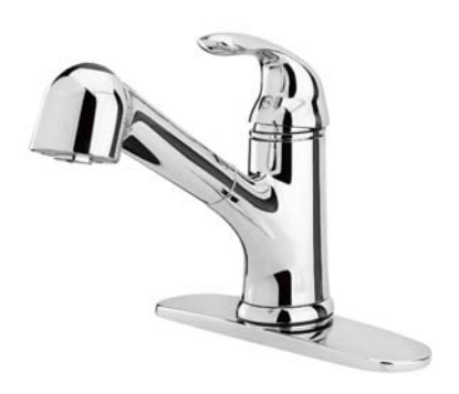
Single Handle Kitchen Faucet Chrome-Plated Finish 3/8" Compression Connections Pull-Out Spray